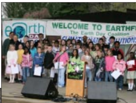
2008 Art, Poetry and Essay contest winners

Fields Tower City and Great Northern, Glaceau Vitamin Water, Stone Oven, Wal-Mart Steelyard Commons, Einstein Bagels and Bialys Bagels, Printing Partners in Middleburg Heights, PIP Printing in Garfield Heights, Dave's Supermarket, Amy Joy, Donut Connection, and Donut Scene. Thanks also to the many volunteers, team and board members for your commitment to environmental stewardship, sustaining our mission to provide education, inspire leadership and encourage action for a healthy environment, showing support