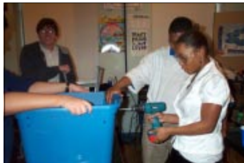
Garrett Morgan students construct vermicomposting bins for their red wigglers.

“Watershed Quality” Students at West Geauga have begun a campaign to establish the spotted salamander as Ohio’s state amphibian. While we have a state drink (tomato juice) and a state rock song ( Hang On Sloopy ), we currently have no state amphibian. They chose the spotted salamander because it is an indicator species, disappearing when water quality is poor, and is present in 86 of Ohio’s 88 counties.